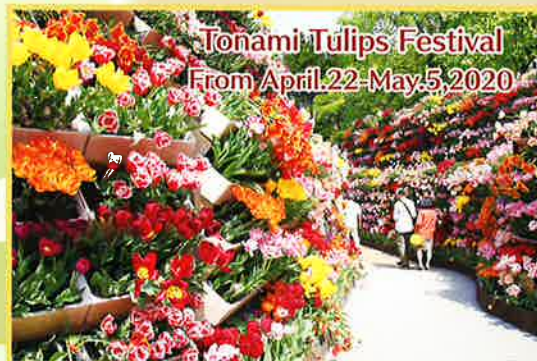
Tonami Tulips Festival From April.22-May.5, 2020