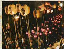
More than a thousand people holding paper lanterns illuminated by candles lead the Okoshi-daiko procession.