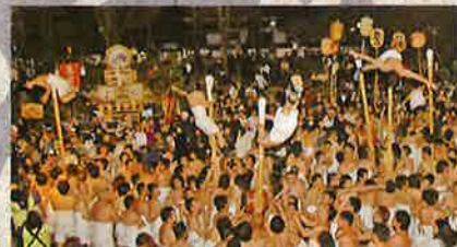
Before starting the parade of Okoshi-daiko, Tsuke-daiko group members take turns balancing atop of the Tsuke-daiko poles.

There are two highlights of Furukawa Festival. One of them is "Okoshi-daiko (rousing drum)," which is held on the night of April 19th. Okoshi-daiko, the big Japanese drum structure, is carried through the streets by hundreds of half-naked men. During Okoshi-daiko parade, the 12 neighborhood groups of men follow the main drum with their small drums called Tsuke-daiko (attaching drums). They become very aggressive and charge upon the main drum, since the position directly behind the drum structure is highly esteemed. Okoshi-daiko represents the DYNAMIC aspect of the Furukawa Festival, which is known as one of the most eccentric festivals in Japan.